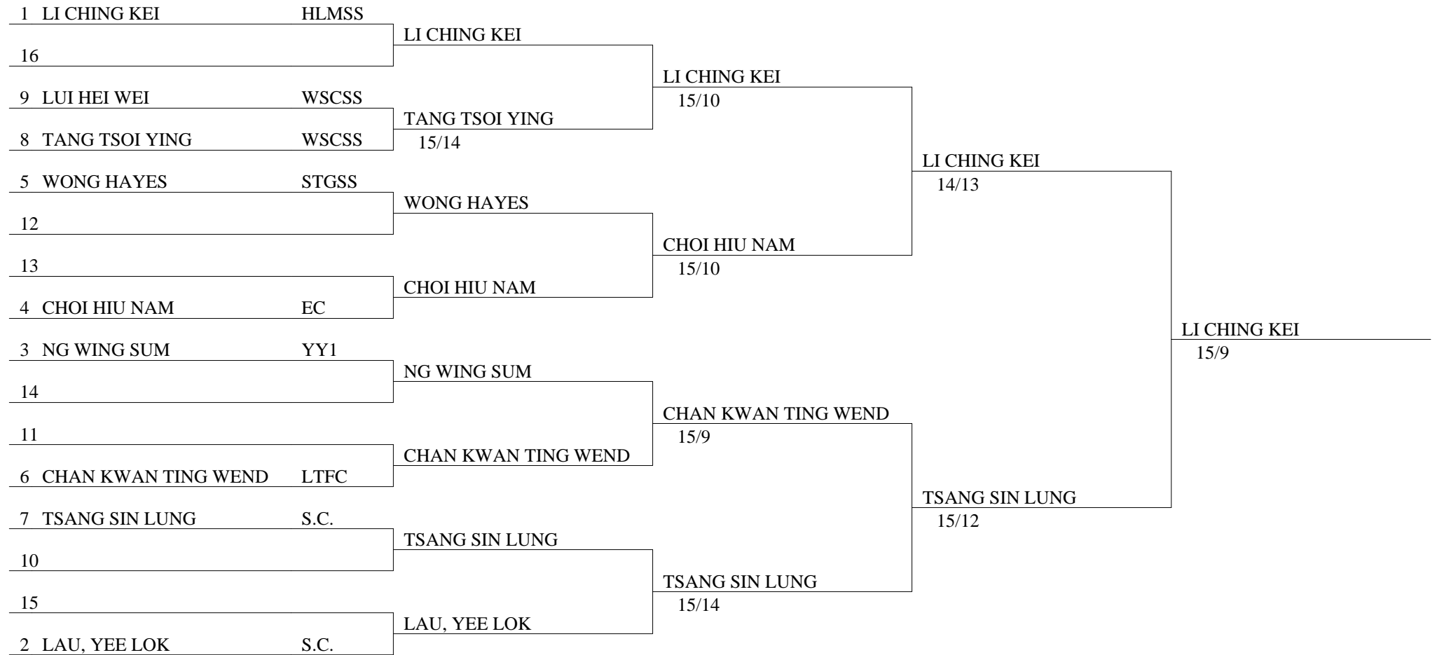
Tableau of 16